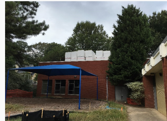
Delivery of roofing materials