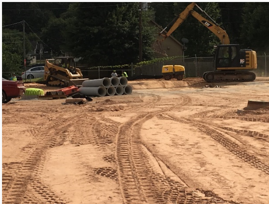
Installation of site utilities