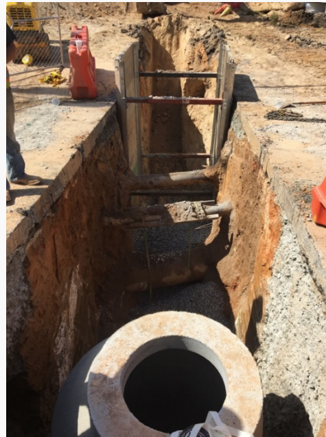
Sanitary tie in at Welch Street